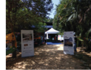
Hundred Hands Exhibition at Jai Mahal