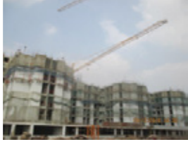
Periphery safety net and vertical safety net – Tower D