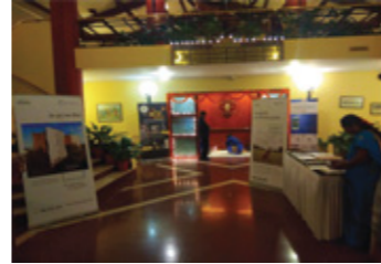
Diwali Night at Karnataka Golf Association