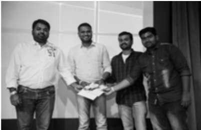
Runners Up (H&N Projects Team)

LIGHTS, CAMERA, ACTION WINNERS Design Team - Best Movie RUNNERS UP Project Team (Here & Now) - Best Scene (Comedy)