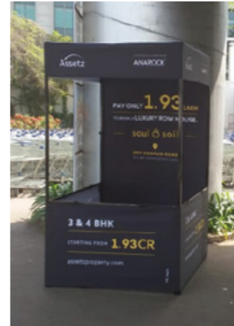
Metro Cash & Carry