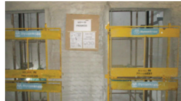
Temporary doors for the lift provided at tower C

The drop test consists of a sand bag weighing 65 kgs, dropped from a height of 7.5 meters onto the safety net to check its stability. The safety net absorbed the fall perfectly. This test was conducted in presence of all labourers to explain to them the functioning and the stability of the safety net.