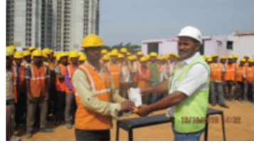
Safety motivational program