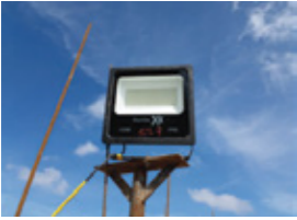
LED lights for avoiding fire hazards and to reduce power consumption